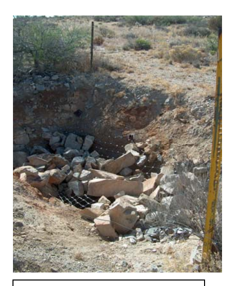
Mineshaft with protective