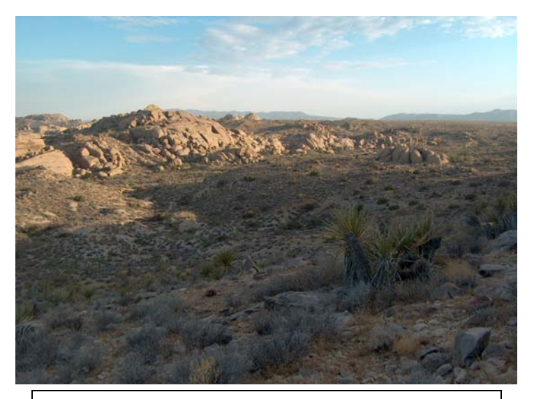
View to the southeast from the Lucky Boy Vista

mine shafts to your right. Explore but take care since the vertical shafts are dangerous. A short distance beyond the mine area is a beautiful overlook.