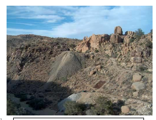
Main tailings at Desert Queen Mine

All that remains of the mining operation today is a huge pile of ore tailings; the foundations of a rock cabin, two cyanide tanks, miscellaneous machinery, and fenced off shafts. At the fork in the trail bear left to an overlook of the mining area and an interpretive sign. Return to the fork and follow the other trail to the old stone cabin. Past the cabin, on your way to the mine area, there is a short stretch with small loose rocks--alert children to take care as they make their way down. Be on the lookout for