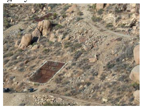
Bat friendly mine shaft covering