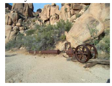
Abandoned machinery built by the Chicago Pneumatic Tool Company